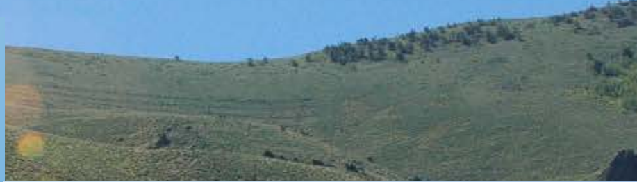
Regrowth after PJ treatment