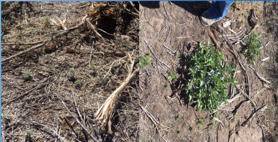
Regrowth after chipping