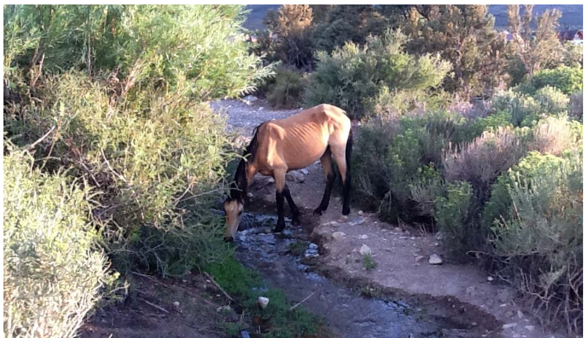
Photo taken by Julie Gleason (used with permission) - taken at Cold Creek HMA, Eastern Nevada, 2012.