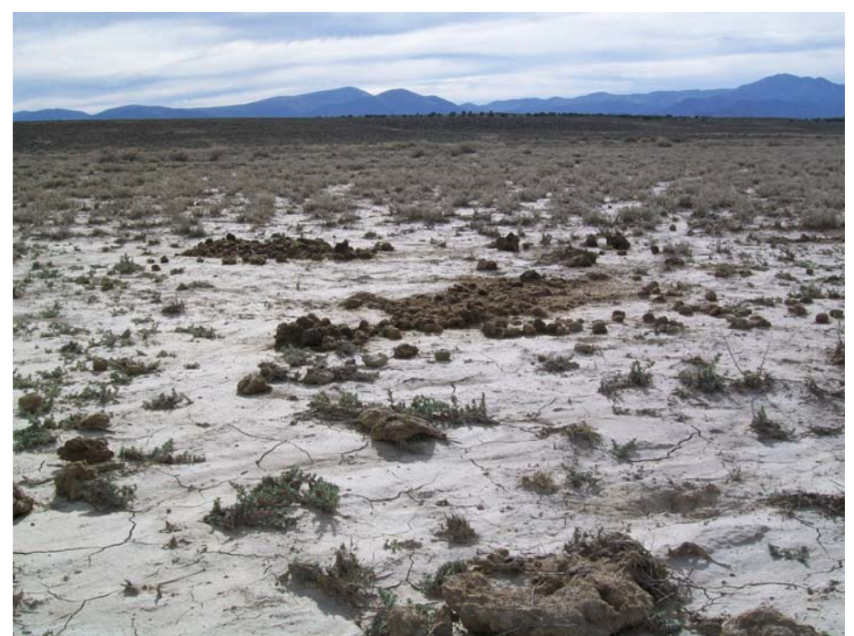
taken at Fish Creek Allotment, Antelope Valley, Eureka County, NV, July 2012