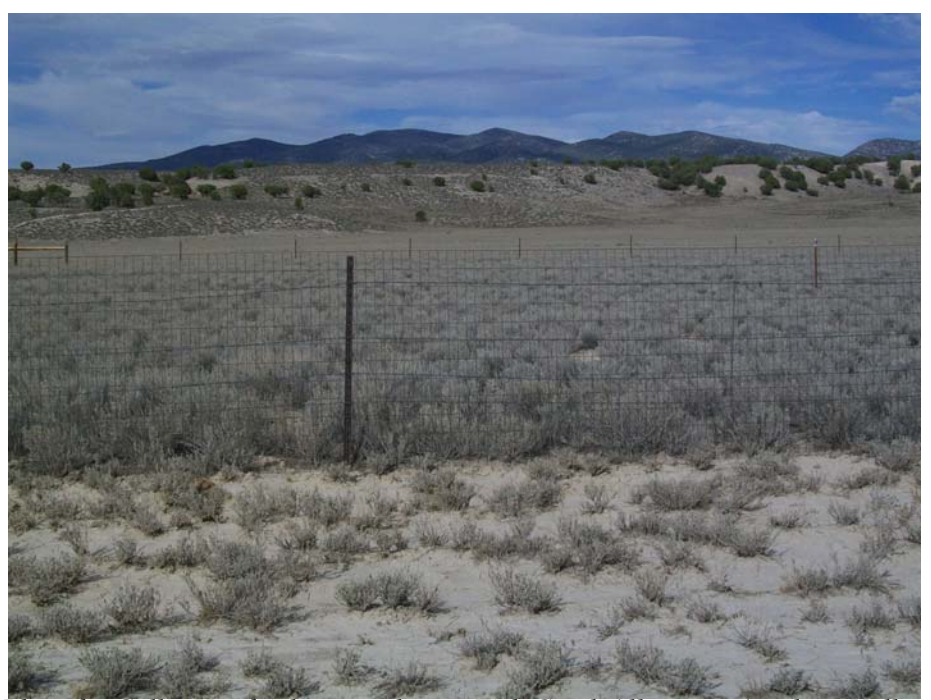
taken at Fish Creek Allotment, Antelope Valley, Eureka County, NV, July 2012.

In the photos below, the population of wild horses in this geographic area was at 142% - 239% of what the BLM had determined was sustainable. This was an area within which livestock use had not "generally occurred ... since 1994." Grazing that has occurred is permitted for use during the dormant season only. The degraded condition of the native salt desert shrub plant community due to the overuse from horses is apparent.