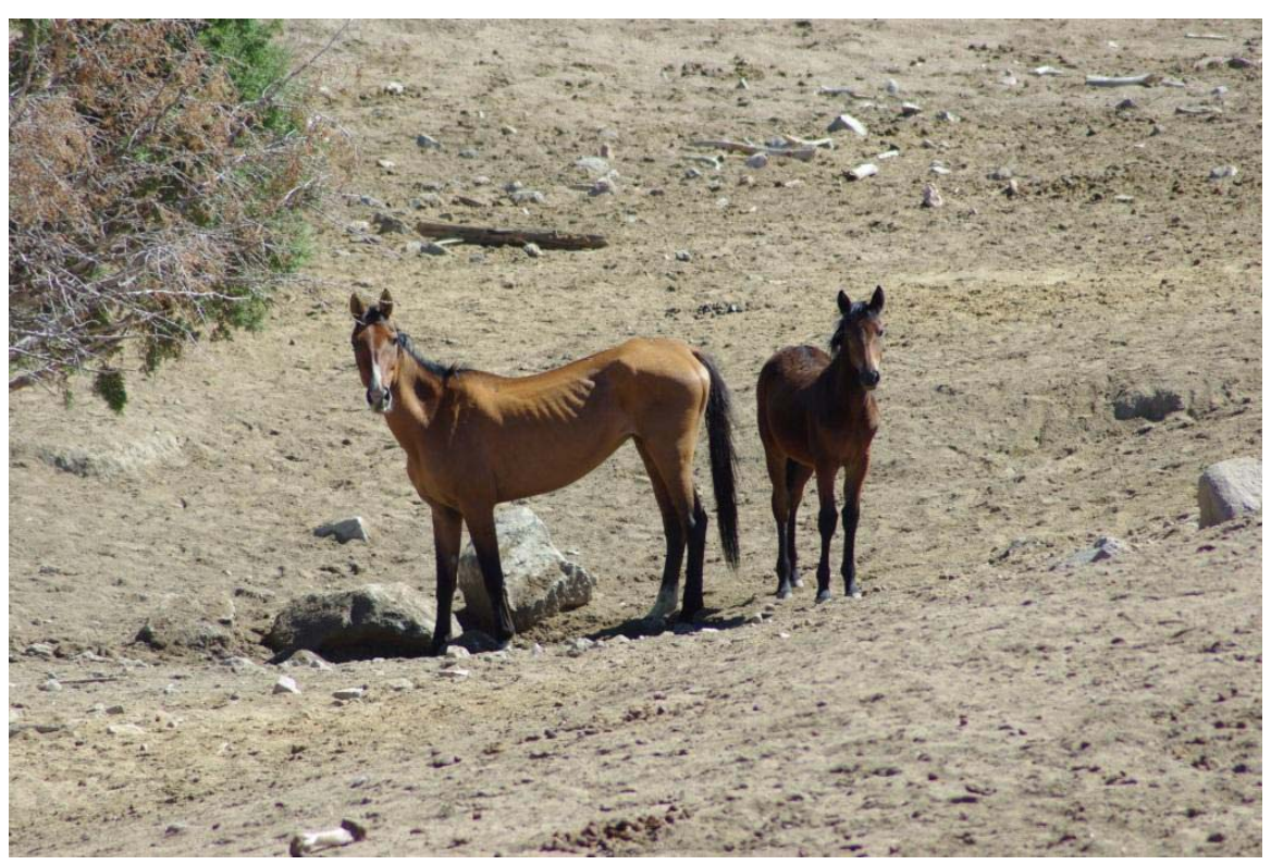
Mare and foal at Deer Spring conveyance (September 2010). Permitted livestock season of use is from 11/1 to 5/15.<sup>1</sup>

The photo below shows horses at the Deer Springs Area Conveyance in Eastern Nevada. Ribs and other bones show the poor body condition and compromised physical health of the horse due to insufficient forage. Horses in this condition are ill prepared for winter months. The photo also shows a spring that has been completely denuded by horses as well as "stomped down" so that the water is no longer accessible.