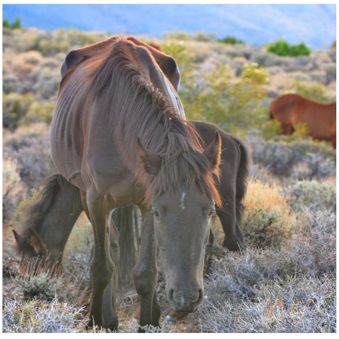
taken at Cold Creek HMA, Eastern Nev, 2012.

The following photos were all taken at the Cold Creek Herd Management Area (HMA) in Eastern Nevada in 2012. This area is overpopulated with wild horses who compete with each other and with wildlife for food and water.