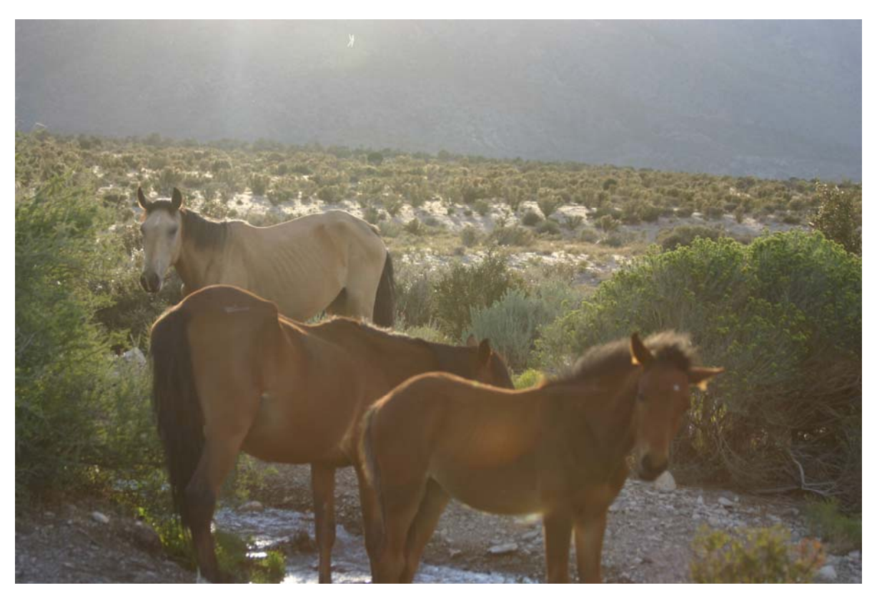
Photo obtained from Eureka County Dept. of Natural Resources - taken at Cold Creek HMA, Eastern Nevada, 2012.