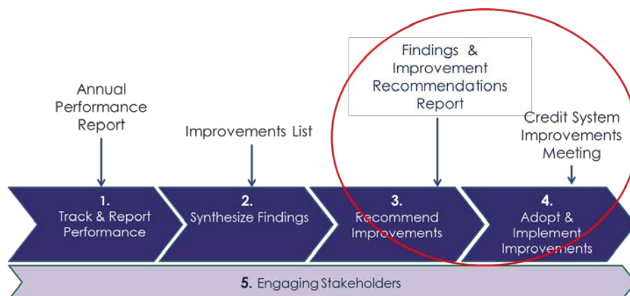
Figure 1: Credit System continual improvement process

The process for producing this report is summarized in Section 3.3: Adaptively Managing the Credit System in the Credit System Manual. During the implementation of the first continual improvement cycle in 2015, the SETT defined a slightly revised five-step annual process, which is illustrated in Figure 1 below. The red circle indicates the steps in the continual improvement cycle during which this report is produced and the SEC considers adoption of the improvement recommendations in this report.