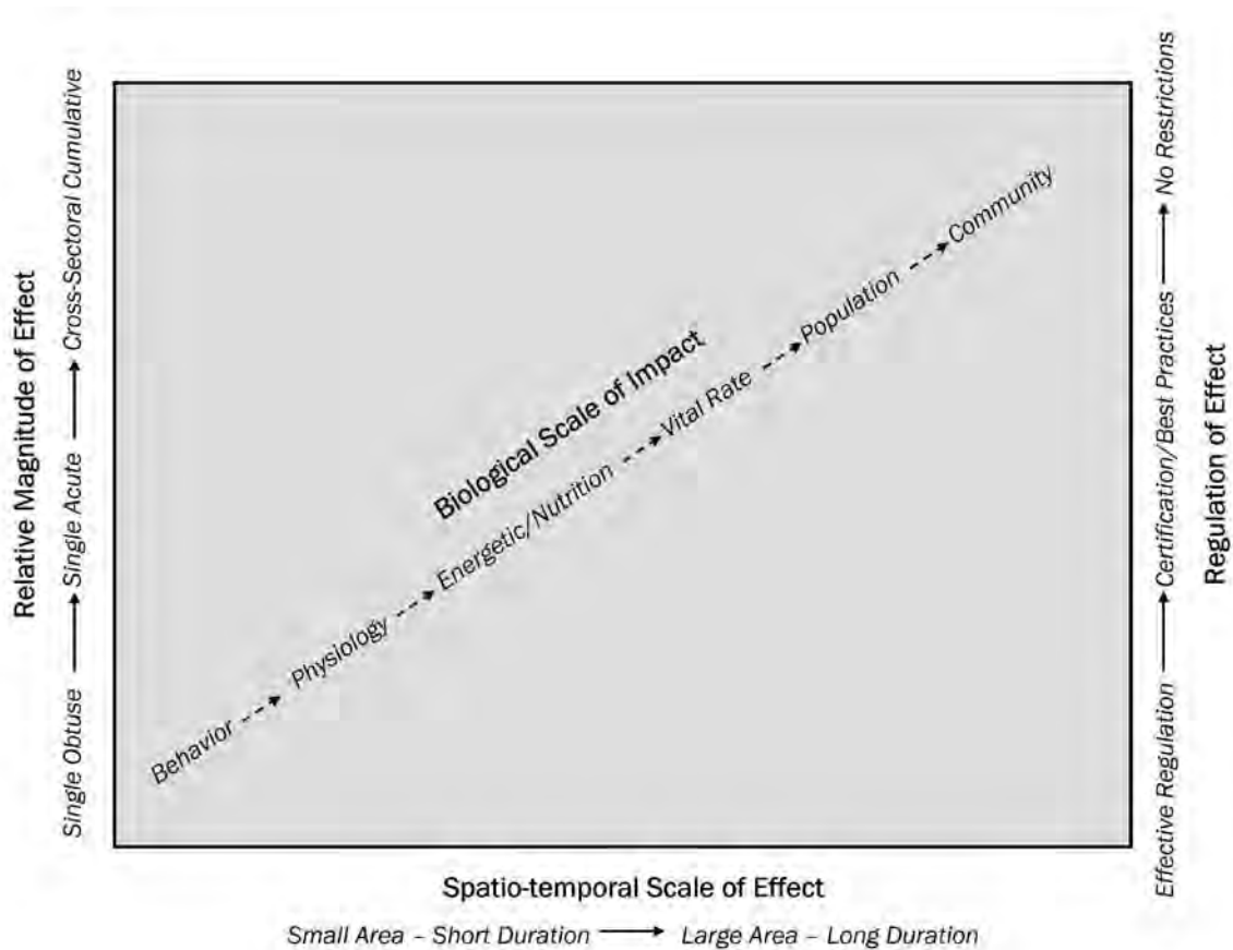
Figure 2. Schematic representation of a typology for classifying and predicting the impacts of human-wildlife interactions (as modified from Johnson and St-Laurent 2011).

The large spatial scales occupied by sage-grouse seasonally (as much as 1,700 mi 2 ; Leonard et al. 2000) have made research on how they respond to habitat perturbations difficult to conduct. Although strength of inference is strongest for replicated experiments, studies of this nature have not been conducted on large scale perturbations such as oil and gas developments, wind farms, coal mines, powerlines, etc. We therefore relied on retrospective and correlational studies that looked at changes in sage-grouse distribution, abundance or demographic rates over time following these developments. We gave greater credence to conclusions obtained from multiple studies conducted at different locations at different times that showed similar results.